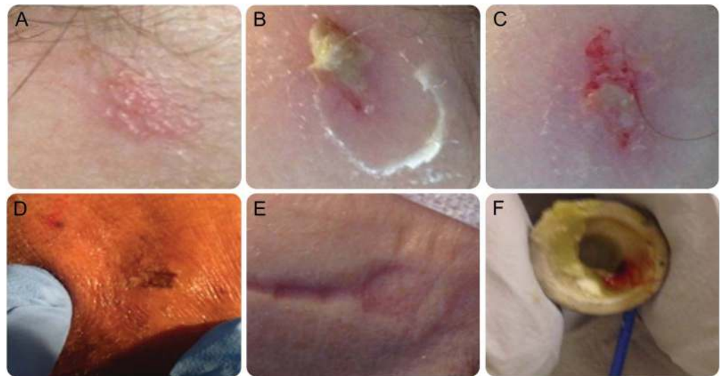
Figure 1 Examples of continuous EEG (cEEG)-electrode-related pressure ulcers (EERPU)

Lesion staging was determined retrospectively by review of the EEG technician's written descriptions and by review of hospital safety reports, which are routinely filed for any lesions noted by the bedside clinician (usually the nurse) to be of severity greater than stage 1. EERPU stages were assigned following standard definitions, as follows: stage 1 for hyperemia without the presence of ulcers or blisters (A); stage 2 for shallow open ulcers or intact blisters without subcutaneous fat exposure (B-D); stage 3 when there was full-thickness tissue loss with exposure of subcutaneous fat but no visible bone, tendon, or muscles; and stage 4 for full-thickness ulcers with exposure of muscle, tendons, or bones. EEG technicians were trained to report any skin disruption to the primary care team and to the nursing staff. The decision to continue or terminate a cEEG study was made on a case-by-case basis with the involvement of the entire care team. A clinical nurse specialist was consulted by the EEG technician or the nursing staff to examine skin breakdown with attention to lesions of stage 2 or greater. The National Database of Nursing Quality Indicators was used to stage per the hospital's inpatient quality control policy. (E) Pressure implantation effect on the subjacent skin after 24 hours of lead placement. (F) An electrode with blood and paste after removal from a patient with EERPU.